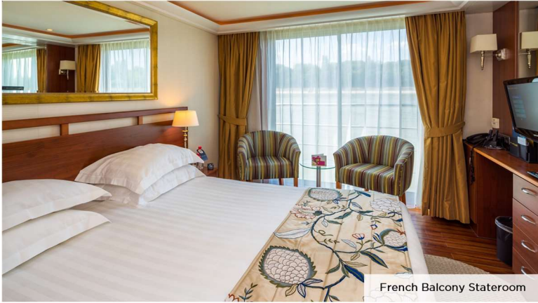
French Balcony Stateroom

7-night cruise | October 11-18, 2025 | Aboard AmaDante